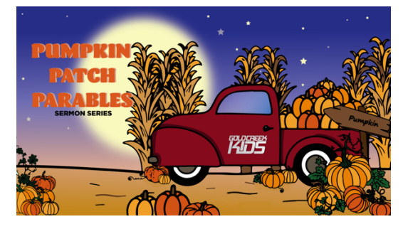
WEEK 1 BIBLE STUDY

**We covered these questions in small groups during service (utilize for additional recap)**