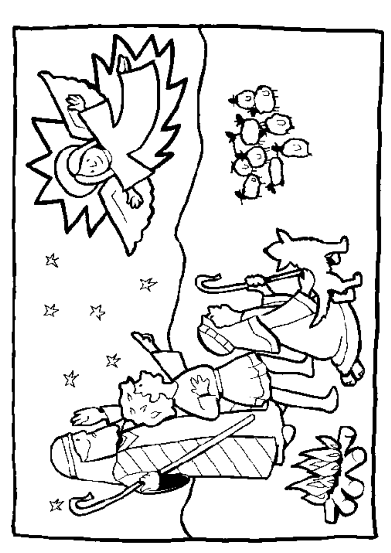
"For a child is born to us, a son is given to us. The government will rest on his shoulders. And he will be called: Wonderful Counselor, Mighty God, Everlasting Father, Prince of Peace." Isaiah 9:6-8