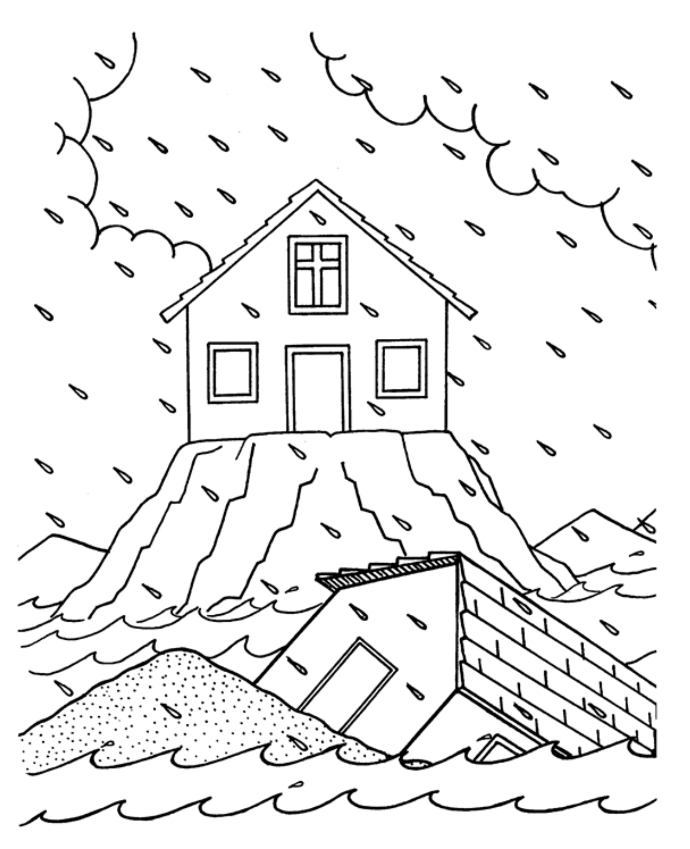
"Commit yourself to instruction; listen carefully to words of knowledge." Proverbs 23:12